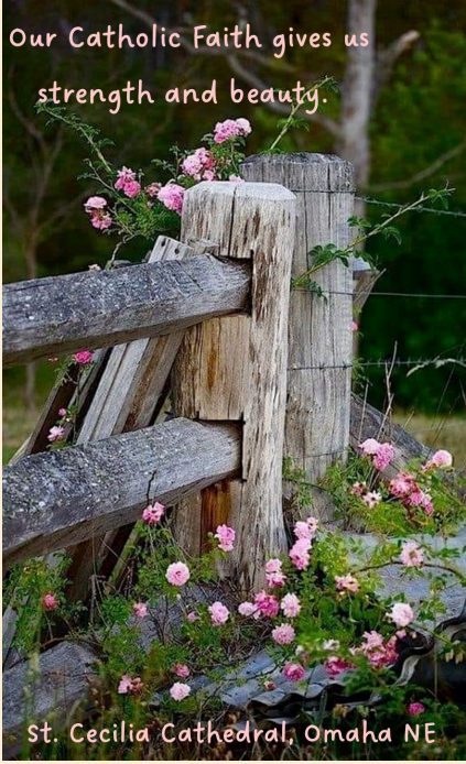
St. Cecilia Cathedral, Omaha NE

Our Catholic Faith gives us strength and beauty.